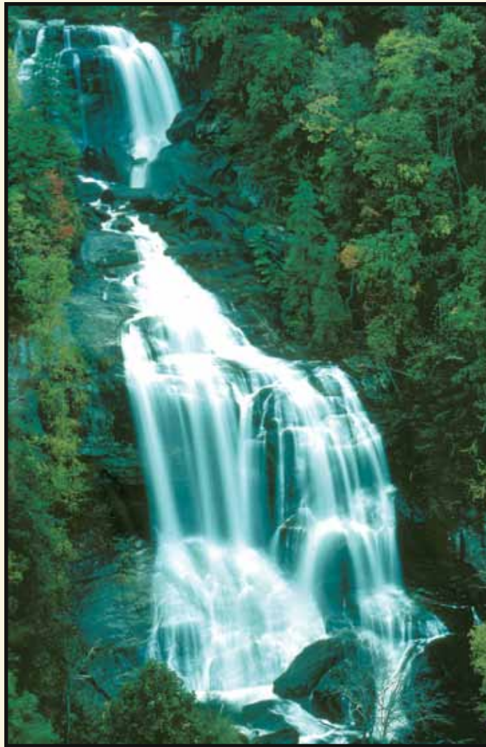
Catch a view of Whitewater Falls from two overlooks.

In the cool, moist shade of steep slopes and rock cliffs, wildflowers and salamanders abound. This wild land is also a perfect haven for a rich array of ferns, mosses, and fungi. Enjoy the beauty of blooms and berries throughout the seasons.