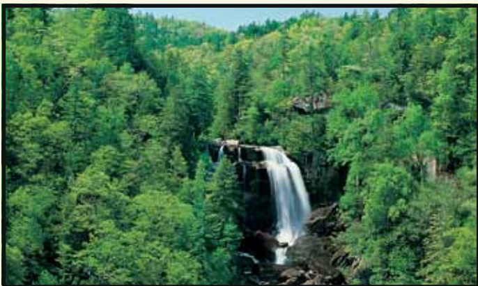
Whitewater Falls plunges over the Blue Ridge Escarpment.